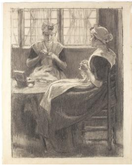
Two seated orphan girls sewing,' Van der Waay Amsterdam Museum