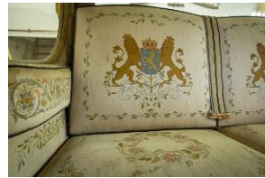
Details of the Golden Coach