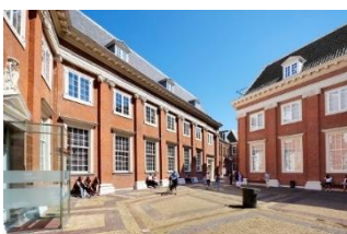
Courtyard at the Amsterdam Museum.

After all these stories and perspectives on the Golden Coach, visitors will have the opportunity to take a closer look at the coach in a tranquil, outdoor setting. The coach will be housed in a special glass enclosure that will give visitors a 360-view of the coach from every angle. In the audio tour, different narrators will explain the features and artwork depicted on the coach and how it can be interpreted.