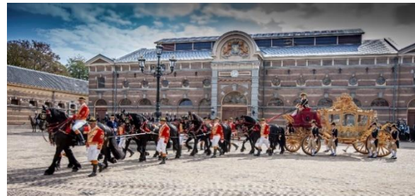
The Golden Coach.

The Golden Coach will be displayed in a glass enclosure in the large courtyard at the Amsterdam Museum. It will be a tranquil setting where visitors can take a closer look at the restored coach. The six interior spaces surrounding the courtyard, each with a unique view of the Golden Coach, will highlight stories connected to the beautiful coach. Hundreds of cultural and historical items, paintings, relics, cartoons, photographs, and videos come together to paint a comprehensive picture of the history of the Golden Coach and the historic and contemporary discussions around this iconic vehicle.