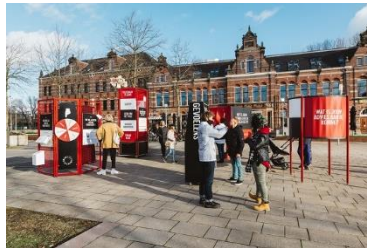
Mobile installation 'Golden Coach'.