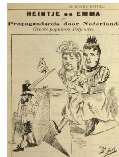
Heintje and Emma in De Roode Duivel. Oct 1894