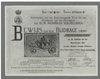
Proof of contribution, Amsterdam City Archives

The idea for the Golden Coach arose from a city in transition. The exhibition starts by transporting the visitor back to Amsterdam at the end of the 19th century, a city rapidly expanding into a modern, confident capital after a long period of stagnation. Railway stations, factories, luxury hotels, and brand-new districts were springing up where city walls had so recently been. The city's population doubled in just thirty years, thanks in part to a massive influx of rural residents. What did the citizens of Amsterdam still have in common?