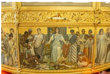
Panel 'Homage to the Colonies'

The artwork on the coach itself features a number of references to the colonies, including the much-discussed panel 'Hulde der Koloniën' ('Tribute from the Colonies'), painted by Nicolaas van der Waay. To understand these references and the commonly held view of the colonies at the time, The Golden Coach takes a look at the colonial exhibition held in 1883 on Museumplein. Around one and a half million Dutch people were introduced to the colonies at this International Colonial and Export Exhibition, and the inventors and creators of the Golden Coach were involved in the exhibit, as well. The Spijker brothers had coaches on display and Nicolaas van der Waay painted allegorical portraits for one of the pavilions. It raises questions about the extent to which they based their depictions of the colonies on the 1883 World Fair. In the exhibition The Golden Coach , we see a diverse selection of what the Spijker brothers and Van der Waay must have seen: an abundance of products, raw materials, and cultural items. The organisers of the 1883 World's Fair intended "to bring modern Western civilisation to the colonial wilderness, and to show the colonial wilds to the modern, civilised public in Amsterdam." That is why artists from the Dutch East Indies and Suriname were also included in the exhibition. Artist Nelson Carrilho, descendant of one of the people from Suriname at the world exhibition, reflects on the colonial exhibition and colonialism in his work.